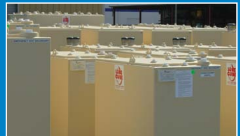
Lube Cube tanks are available in standard sizes from 60 to 20,000 gallons.

For more information call us toll free at